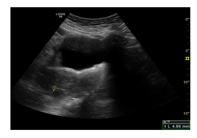
Figure 2: Suprapubic ultrasound - endometrial cavity.