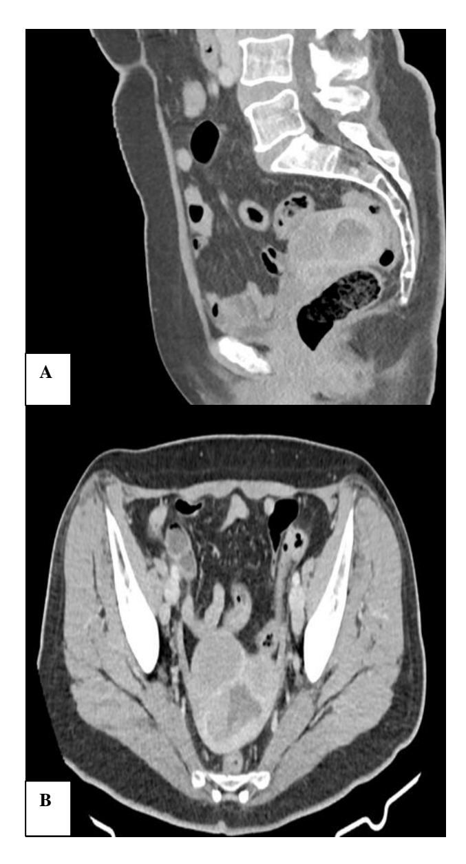
Figure 3: (A) staging thoracoabdominopelvic computed tomography-sagittal image; (B) staging thoracoabdominopelvic computed tomography - axial image.