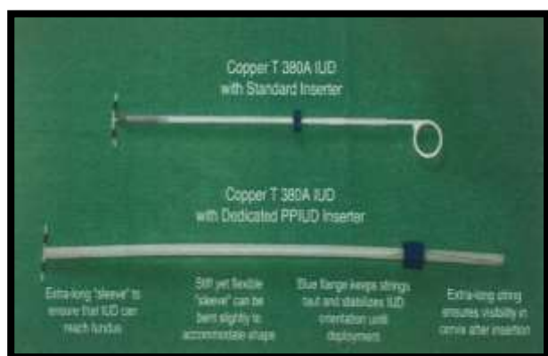
Figure 1: Postpartum intrauterine device inserter.

non-visibility of string will not be there, also perceiving thread ensures patient copper T presence.