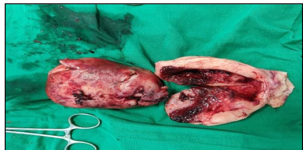
Figure 3: Gross specimen of leiomyoma and uterus.

Patient tolerated surgery well and postoperative period was uneventful. Patient was discharged on post-operative day 4.