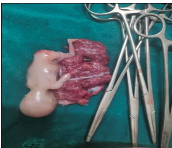
Figure 3: Fetus with placenta.

She had signs of severe dehydration with severe pallor. On per abdominal examination, there was severe tenderness all over the abdomen. Pelvic examination revealed retroverted uterus with bilateral fornical tenderness along with cervical motion tenderness. The patient was carrying an ultrasound report conducted on the previous day in a private diagnostic lab suggestive of bicornuate uterus with single live intrauterine pregnancy corresponding to 10 weeks 2 days in right cornua of the uterus.