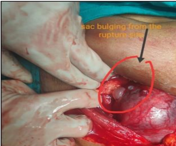
Figure 1: Ruptured right cornua of the uterus with gestational sac bulging through it.