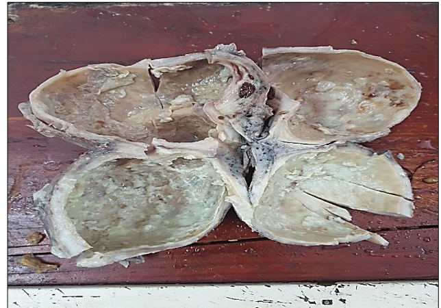
Figure 1: Oophoritis with thick walled cyst containing whitish material.

plasma cells, lymphoid aggregates, neutrophils and multinucleated giant cells.