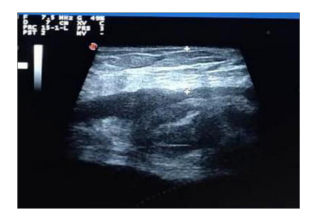
Figure 1: Pus collection in the intramuscular plane in lower abdomen.

electrolytes were normal. Deep vein thrombosis was ruled out by lower limb Doppler ultrasonography and started on injection enoxaparin according to the weight of the patient as the patient was not ambulatory. Pelvic x-ray showed diastasis of symphysis pubis. It progressed very rapidly and involved lower abdomen. USG abdomen showed 8.2 × 3.1 cm septate collection in the intramuscular plane, suggestive of abscess (Figure 1).