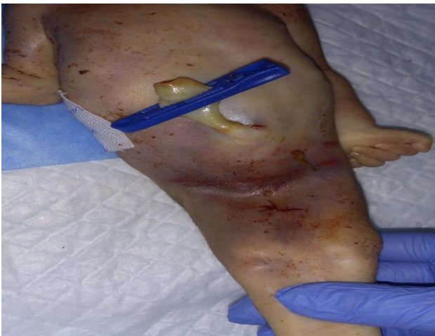
Figure 2: Absent external genitalia in sirenomelia (External genitalia visibly absent presented as a dimple).

External morphological examination showed malformation of lower limb as complete fusion of limbs ending up with fused flip like feet with knob like structure representing phalanges which were seven in number giving a mermaid like appearance. The external genitalia were visibly absent and was represented by