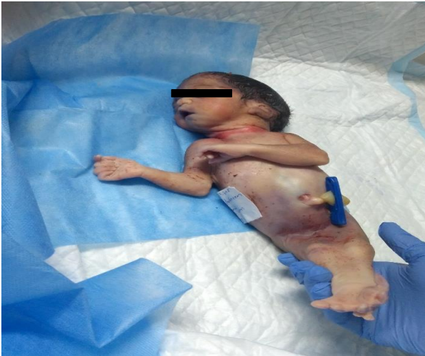
Figure 1: Sirenomelia with potter syndrome (potter's facies with fused lower limb).

kidneys with small urinary bladder. Despite of reduced visibility of complete anatomical details of lower limb owing to anhydramnios, persistent extended breech and static position of lower limb in subsequent ultrasound scan pointed towards this rare congenital entity. Pulmonary hypoplasia was also well anticipated in view of bilateral dysplastic kidneys and anhydramnios. Patient had spontaneous onset of labour at 31 1/7 weeks of gestational age and delivered a live baby having sirenomelia with Potter sequence with poor APGAR score. Baby died within the first hour of life probably because of pulmonary hypoplasia.