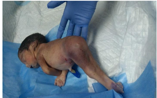
Figure 3: Absent anal opening in sirenomelia.

dimple only. There was no urethral and anal opening (Figure 1, 2, 3).