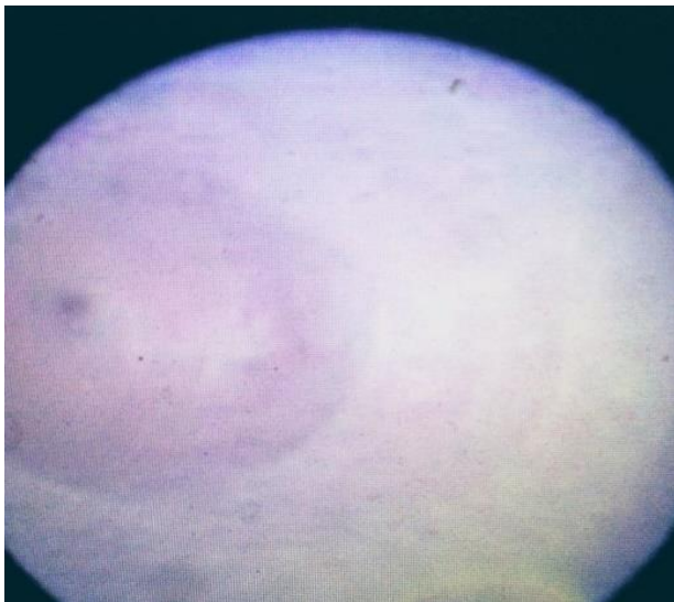
Figure 1: Hysteroscopic view: right ostia seen. Left ostia not visualized covered with fibrous tissue.

Mrs. X, a 25-year-old married female, housewife resident of Agra presented to gynae OPD of RML Hospital, New Delhi with primary infertility in June 2013. Her preliminary work up for infertility was not done apart from USG and MRI. The imaging studies showed a unicornuate uterus with a left sided rudimentary horn. Patient gave history of cyclical left sided dysmenorrhea since menarche. Pain had become recurrent, progressively severe and associated with vomiting since a year. The infertility work up was done. Husband semen analysis was normal. EB was reported as secretory endometrium and TB PCR was negative. HSG was reported as localized spill on right with left tubal block. Patient was taken for diagnostic hystero-laparoscopy on 11 November 2013. Hysteroscopy showed single cervix with normal looking uterine cavity. Right ostia was seen, left ostia was not seen and a white fibrous band due to which lower end could be visualized on left side (Figure 1).