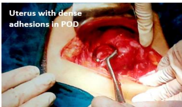
Figure 2: Endometriotic dense adhesions and fixed uterus at laparotomy.