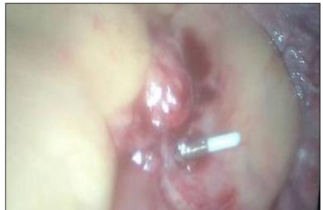
Figure 3: CuT entangled in bowel and omental mass (Case 2).

CuT was not seen on hysteroscopic examination. Diagnostic laparoscopy was performed. CuT was seen adherent to the anterior abdominal wall, entangled in omentum, which was removed laparoscopically after adhesiolysis (Figure 2).