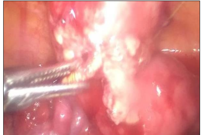
Figure 2: Laparoscopic CuT retrieval (Case 1).

The two cases, in which Cooper T was not seen on TVS but was found in X-ray Abdomen Erect, underwent diagnostic hystero-laparoscopy.